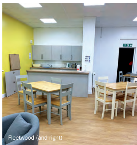
Fleetwood (and right)

To find out more about the Methodist Grants programme, visit: www.methodistinsurance.co.uk/grant-giving