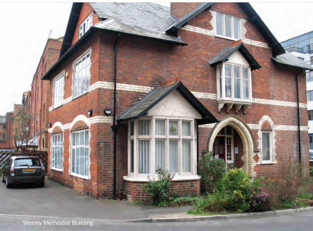
Wesley Methodist Building

More than £2.5 million pounds headed to churches and Methodist organisations across the UK and Ireland in 2020, boosting community engagement and encouraging church growth.